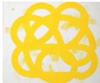
Distance Painting (18') (1034)