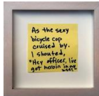
Untitled (#15 from the series, "Post It Notes") (1077)