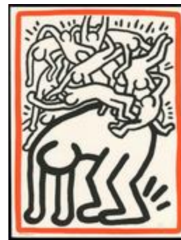
United Nations - Fight AIDS Worldwide (1133)