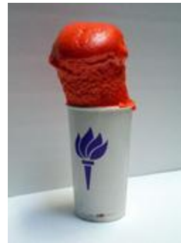
Studio cup (eternal flame) (1858)