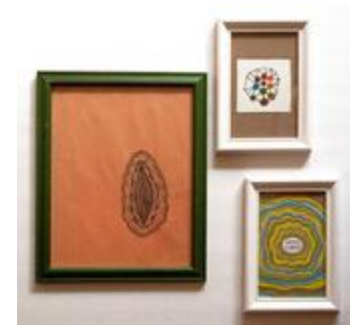
(three pieces intended as a triptych) (1227)