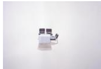
Wildlife (series) (1253)