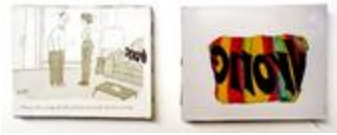
Artifact Context (1218)