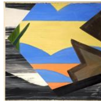
Comic Sublime #3 (1273)