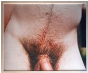
Because I'm a Girl (1249)