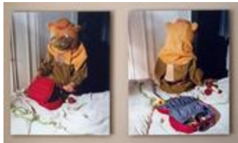
Suitcase (diptych) (1105)