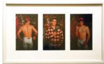
Paul's Gun I-III (1263)