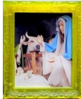
Untitled (Cuban Virgin) (1107)