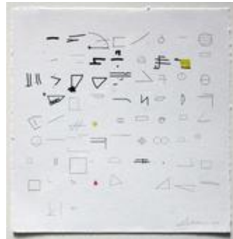
Mechanical Turkers: draw three lines, draw a circle with the center at left end of the base that touches the right end of the base,