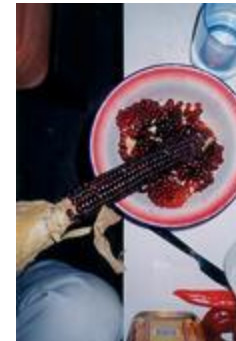
Indian corn and pomme granate (1174)