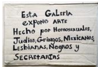
Esta Galeria (from an ongoing series of cardboard signs) (1237)