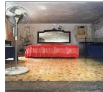
Hotel Trinidad (1293)