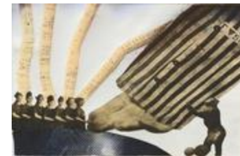
The Trout (1065)