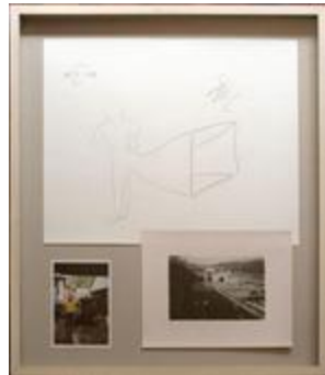
Composition for the Lincoln Tunnel #3 (1110)