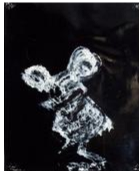
Movie Mickey (1675)