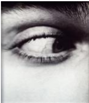
Untitled (Eye) (1193)