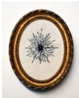
Untitled (from the series "Aerial and Ground Explosions") (1248)