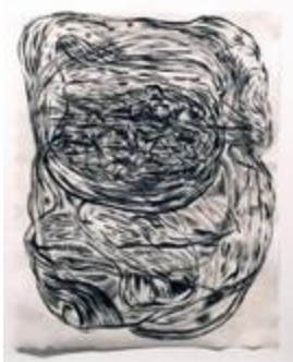
unknown (Pat Hearn benefit drawing) (1167)