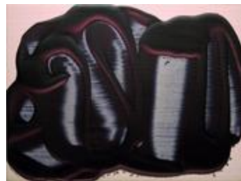
Maine Color Study #9 (#380) (1164)