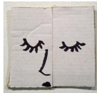
Untitled (Face) (1373)