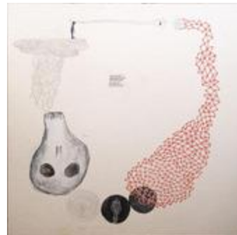
Ori I mi (my mind saves me) (1229)